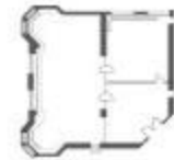
THE DERBY SUITE P8