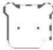
THE TRAFFORD ROOM P84

Whichever spaces and set-up you choose, be assured that all of our rooms are fully air-conditioned, provide dimmable lighting and benefit from plenty of natural daylight.